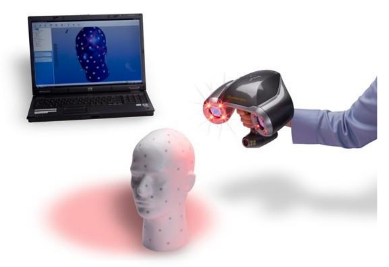
Figure: Demonstrative of Commercially Available 3D Scanner<sup>8</sup>

Some basic, common steps apply to all additive manufacturing technologies. All 3D printers require a digital model (i.e., a digital blueprint) of the part to be produced. This model may be generated by reverse engineering, a process where an existing part can be 3D scanned to produce a digital model of the physical object.